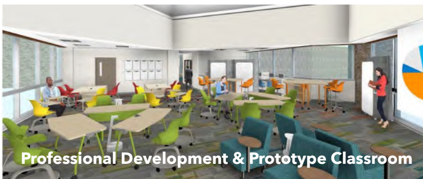
Professional Development & Prototype Classroom